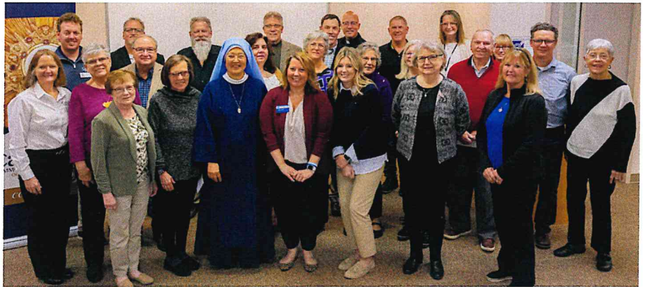
Grants recipients at the Foundation's 2025 Grants Luncheon.

The Catholic Community Foundation's 2026 Grant Application period is now open! Our community grants are designed to support the immediate needs of our entire community throughout Mid-Michigan. Grant applications will close on June 30, 2026.