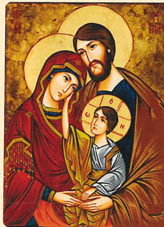
Romanian Sacred Icon