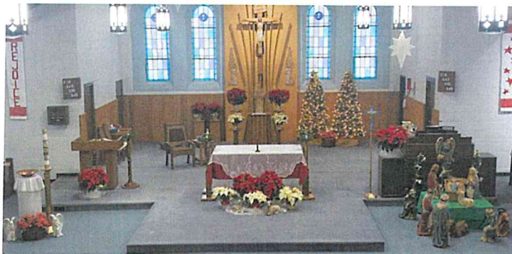
St. Joseph Church

Thank You to everyone who helped make our churches beautiful for the Christmas Season. To those who contributed for our flowers, those who helped decorate and those who helped undecorate. The beauty of our Churches remind us of the beauty of God! Thank You to everyone who cantored or sang in our choirs or sang their hearts out from their pew. Songs give praise to our Savior! Thank You to all our Greeters and Ushers who welcomed all our visitors and extended families. Jesus welcomed all to his table! Thank You to everyone who helped behind the scenes to make it all run smooth. God knows all good deeds done in secret!