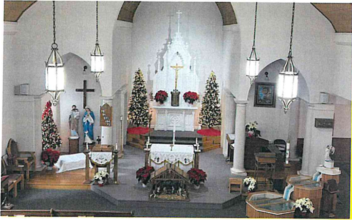
St. Columbkille Church