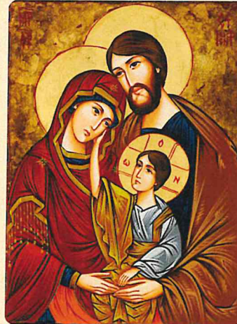
Romanian Sacred Icon