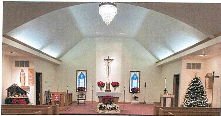
St. Ignatius Church