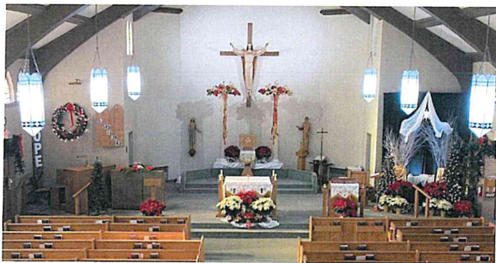
St. John Church