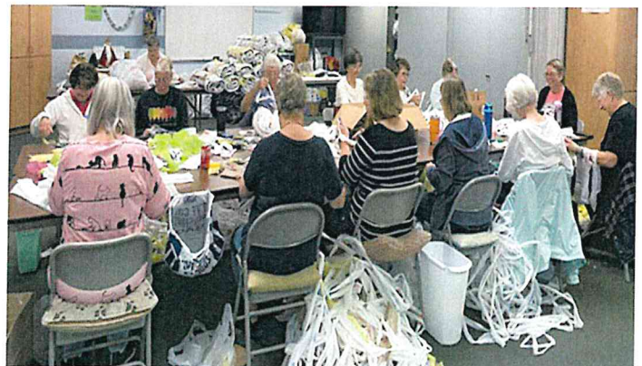
Homeless Mat Ministry