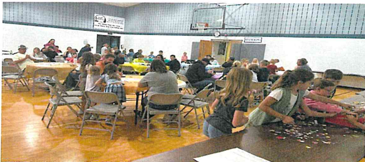
Our First Faith Formation Family Night