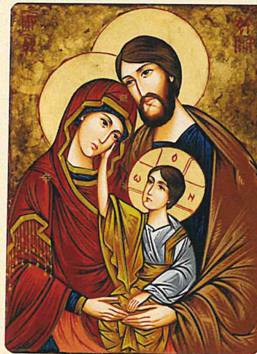
Romanian Sacred Icon – holymart.com

Jesus, Mary, and Joseph, I love you, save souls!