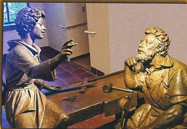
National Shrine of Mary, Queen of the Universe, Orlando, Florida