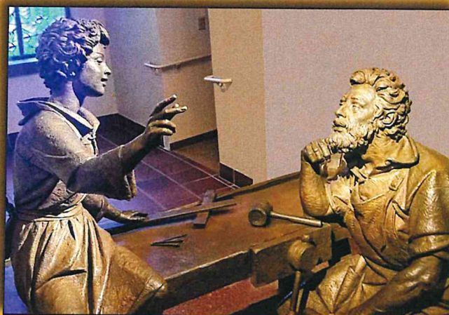
National Shrine of Mary, Queen of the Universe, Orlando, Florida