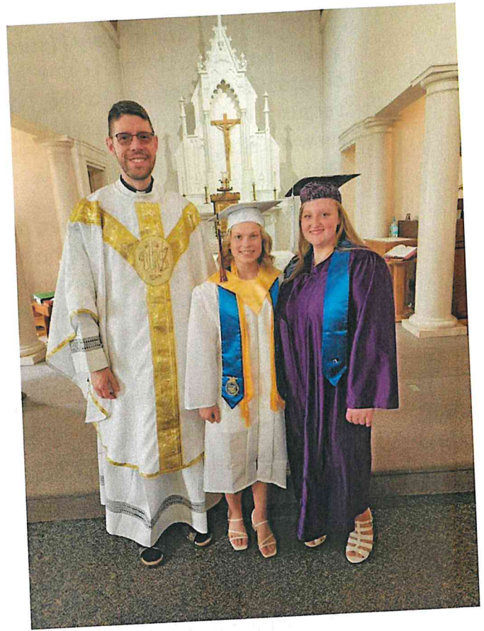
Chaldean Church in West Bloomfield (one of the 21 Eastern Catholic rites. A persecuted church...)

Beloved Son or Daughter of God our Father, Happy Trinity Sunday! Come Holy Spirit!!