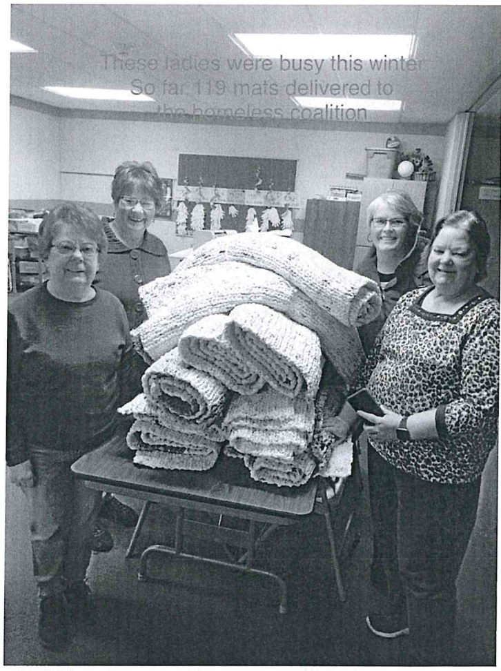
These ladies were busy this winter So far 119 mats delivered to the homeless coalition

"...Therefore, to convert is to let oneself be won over by Jesus (cf. Phil 3: 12) and "to return" with him to the Father" - Pope Benedict XVI, God rest his soul