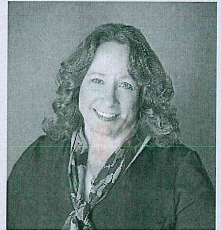
Image Design by: Christ Cathedral Cultural Center 13280 Chapman Ave. Garden Grove, CA United States